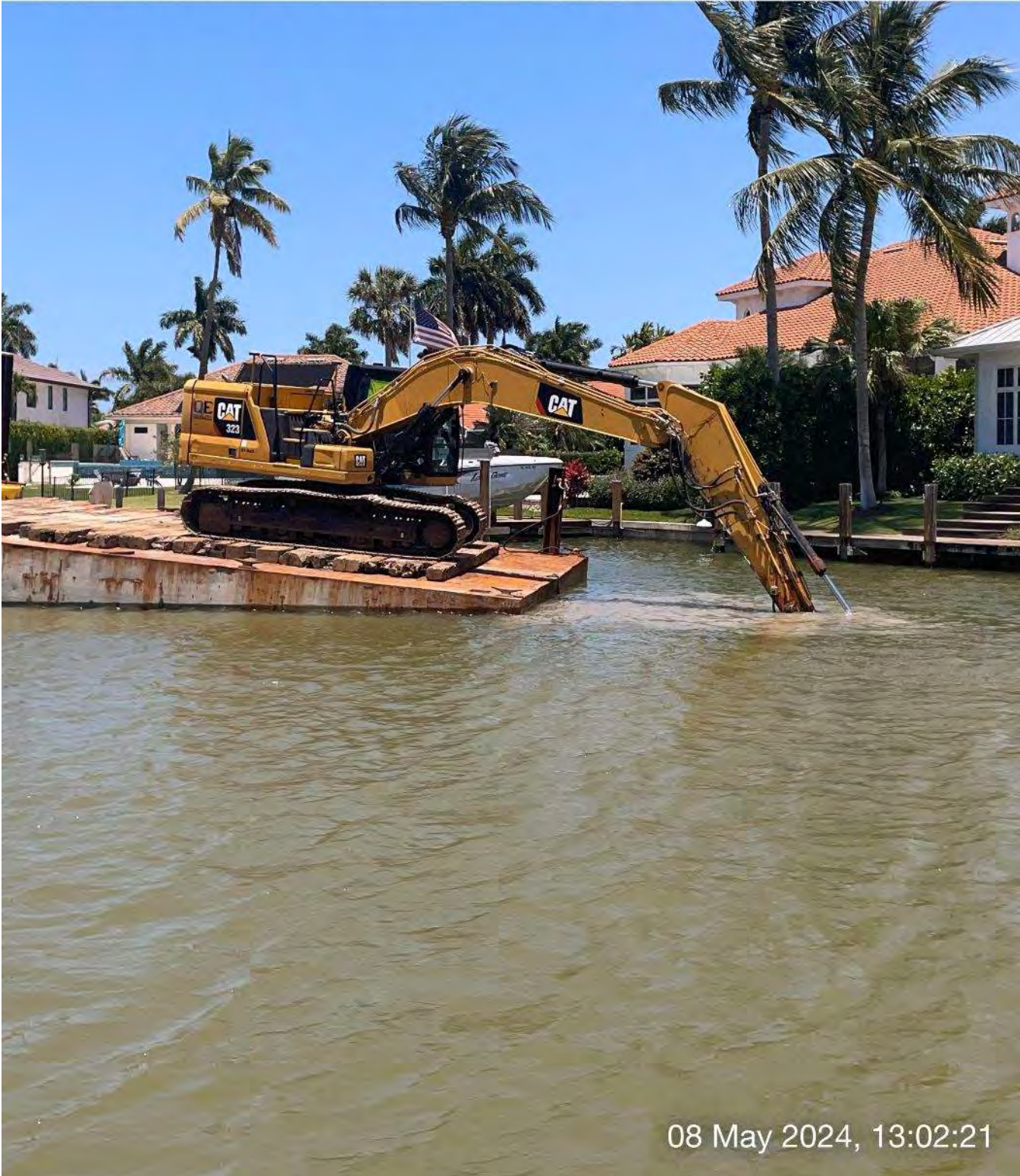
323 excavator grinding rock at station 13+70 in Canal A-A.

☀ 323°NW (T) ● 26°7'24"N, 81°47'2"W ±9ft ▲ 8ft