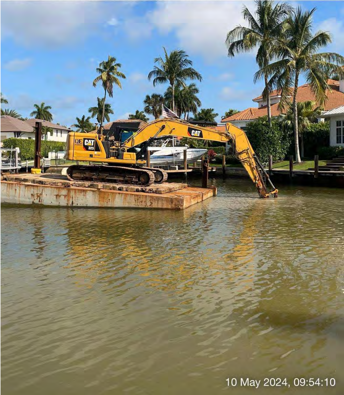
323 excavator grinding rock at station 13+70 in Canal A-A.

☉ 322°NW (T) ☉ 26°7'24"N, 81°47'2"W ±9ft ▲ 18ft