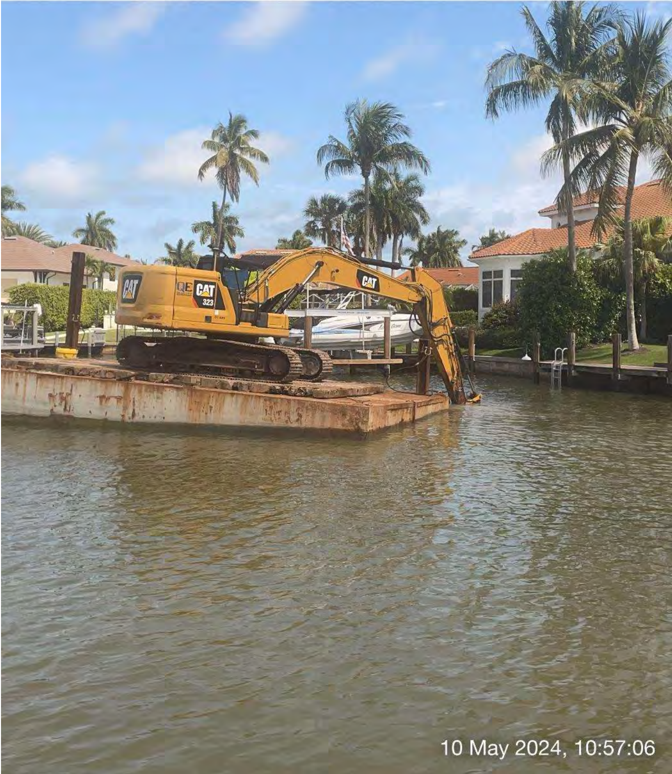
323 excavator grinding rock at station 13+70 in Canal A-A.

☉ 322°NW (T) ● 26°7'24"N, 81°47'2"W ±9ft ▲ 6ft