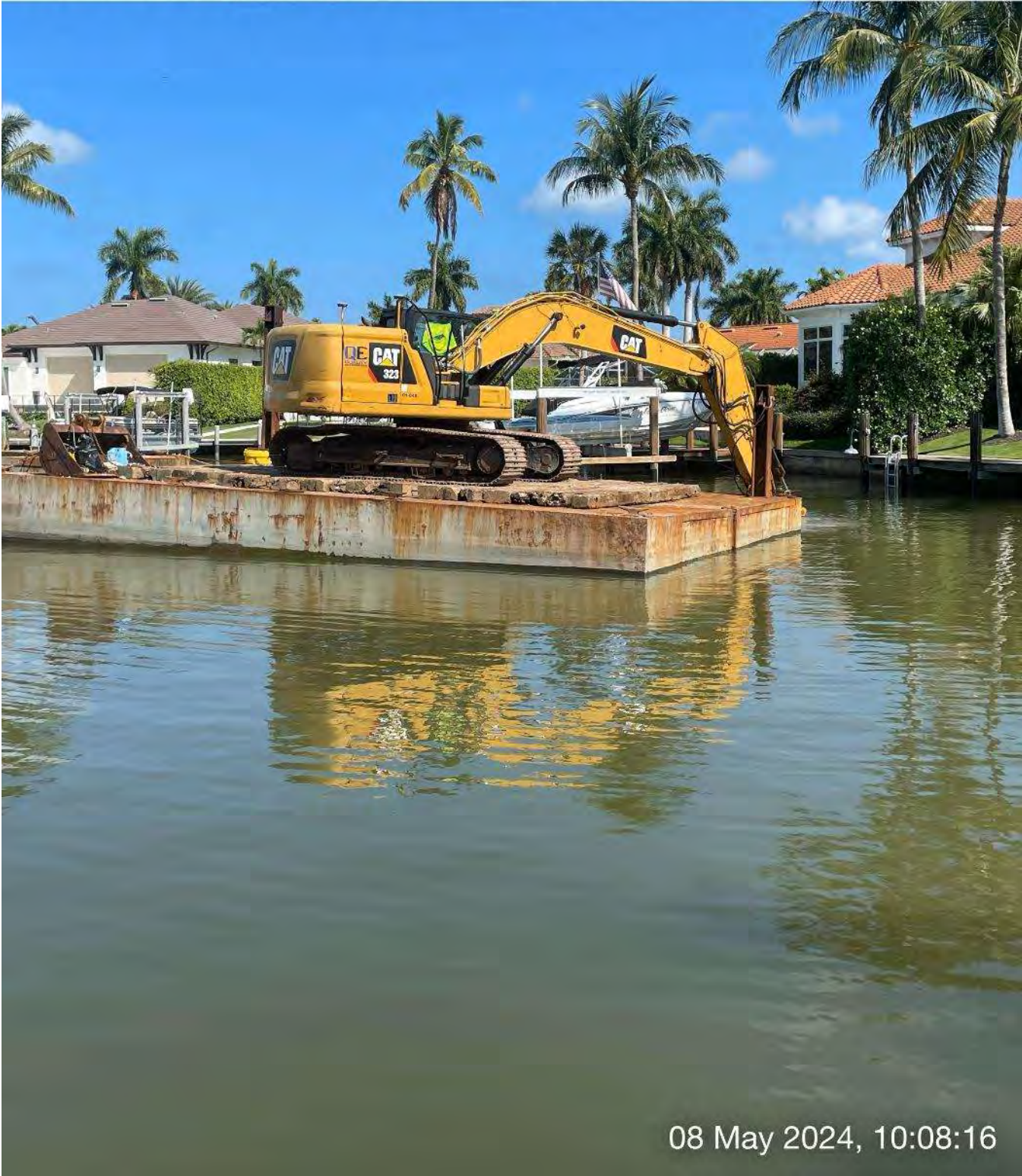
323 excavator grinding rock at station 13+70 in Canal A-A.