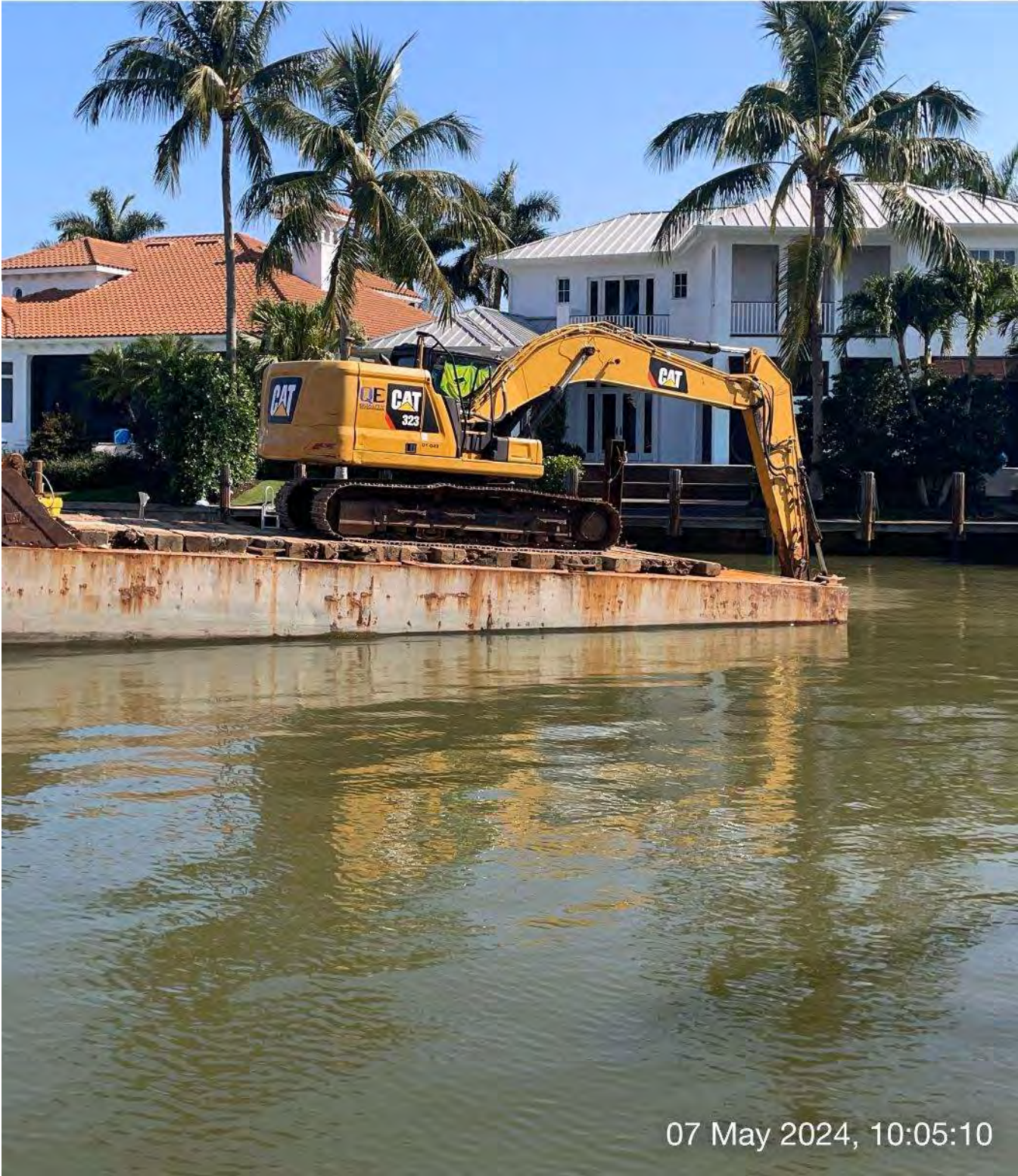
323 excavator grinding rock at station 13+80 in Canal A-A.

☀ 4°N (T) ● 26°7'24"N, 81°47'2"W ±9ft ▲ 8ft