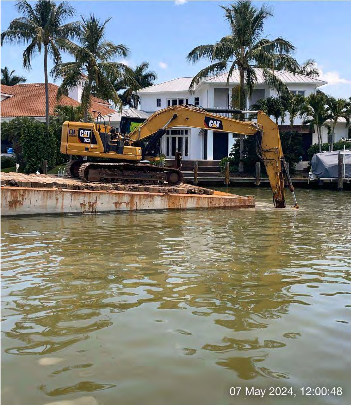
323 excavator grinding rock at station 13+80 in Canal A-A.

☀ 19°N (T) ☉ 26°7'24"N, 81°47'2"W ±9ft ▲ 5ft