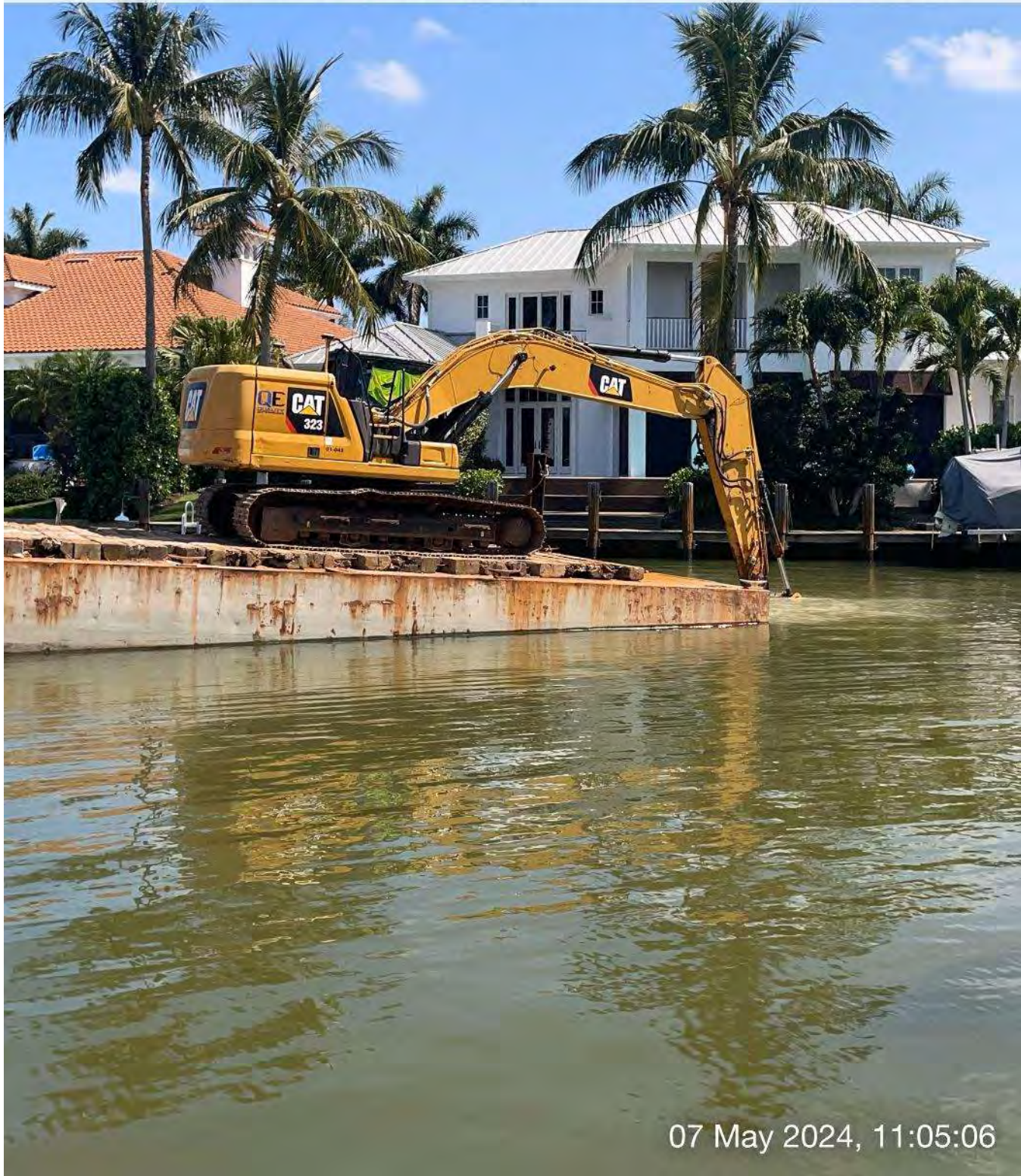
323 excavator grinding rock at station 13+80 in Canal A-A.

☀ 6°N (T) ● 26°7'24"N, 81°47'3"W ±9ft ▲ 9ft