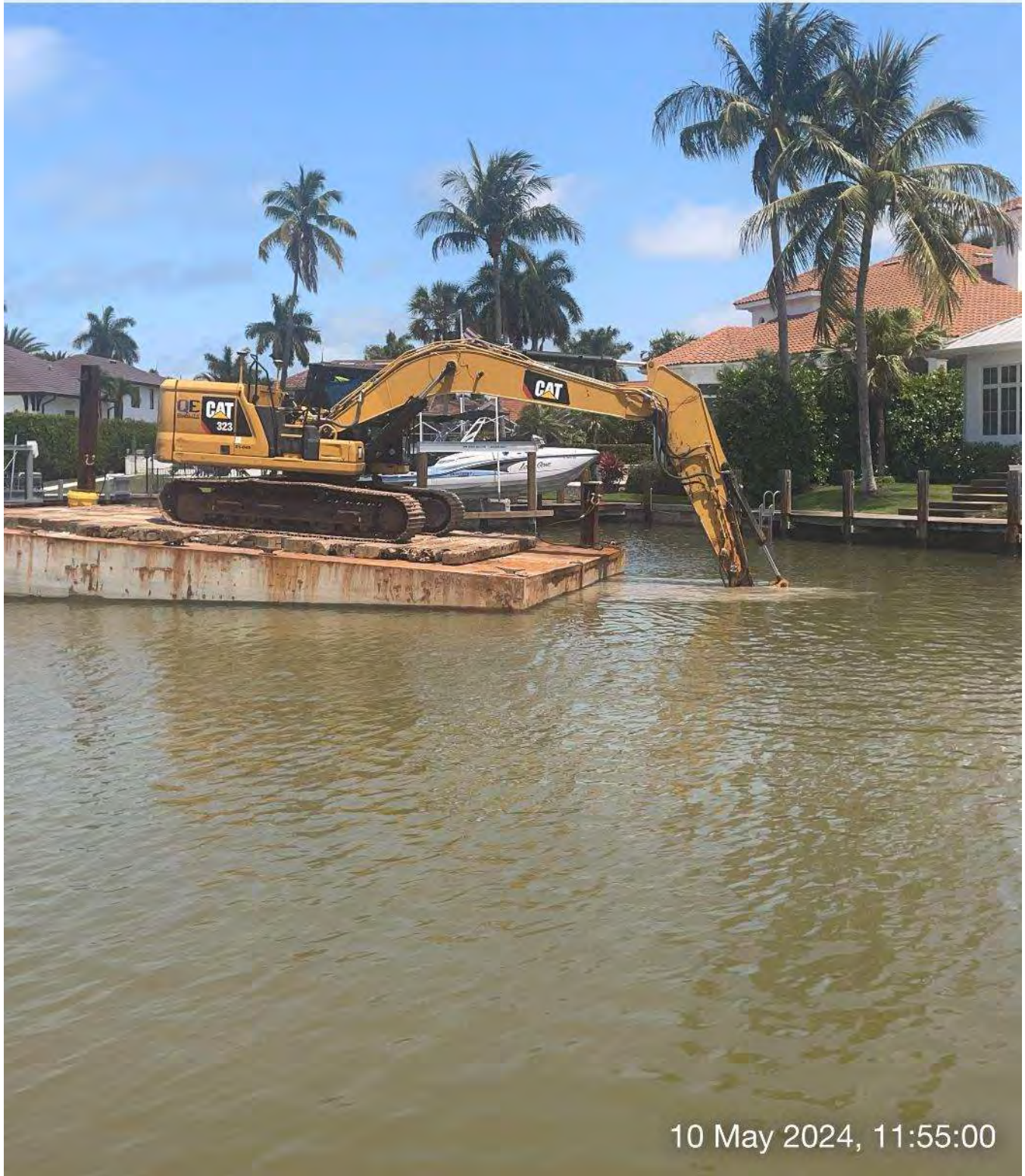
323 excavator grinding rock at station 13+70 in Canal A-A.

☉ 326°NW (T) ☉ 26°7'24"N, 81°47'2"W ±9ft ▲ 10ft